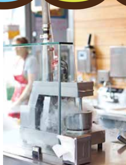
Ice cream shops serving desserts made with liquid nitrogen are unique and very popular.

Note: If you are concerned about the ambiguity of these answers, now you know why ice cream historians are still arguing about the origins of ice cream!