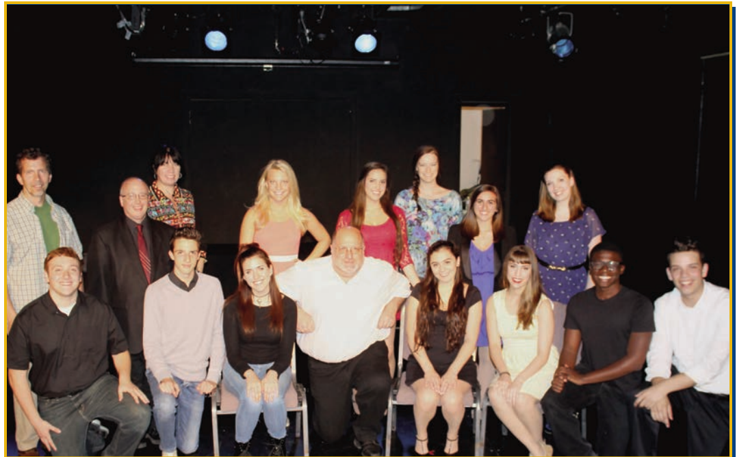
SCVTHS Theater Arts students and staff at the 2014 SCVTHS New York City Showcase

In an effort to gain exposure for students in Somerset County Vocational & Technical High School's Gifted and Talented Theater Arts Program, a showcase was recently held at the John DeSotelle Acting Studio in New York City for eleven junior and senior students.